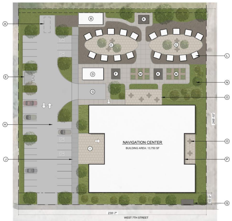
MCCAC NAVIGATION CENTER - SITE PLAN